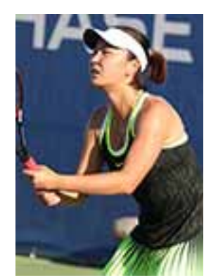
Peng Shuai at the 2016 US Open